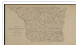
State of Wisconsin