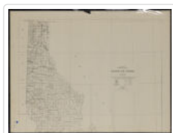
State of Idaho