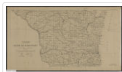
State of Wisconsin