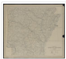
State of Arkansas