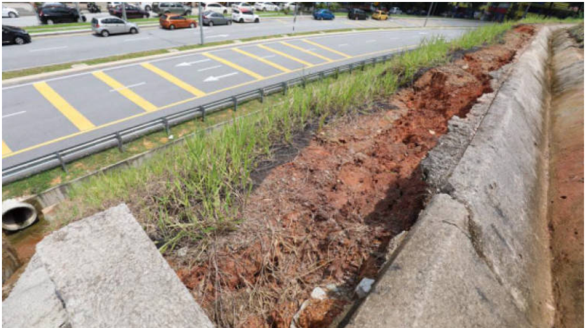
The cliff along Jalan 11 / 55C, Puncak Setiawangsa, Bukit Setiawangsa appears to have fissures measuring half-a-metre, in this photo taken on, May 12, 2017.

KUALA LUMPUR: Residents of Setiawangsa near here are having sleepless nights following the appearance of fissures on a slope in the area.